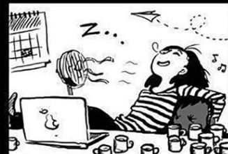
What My Boss Thinks I Do